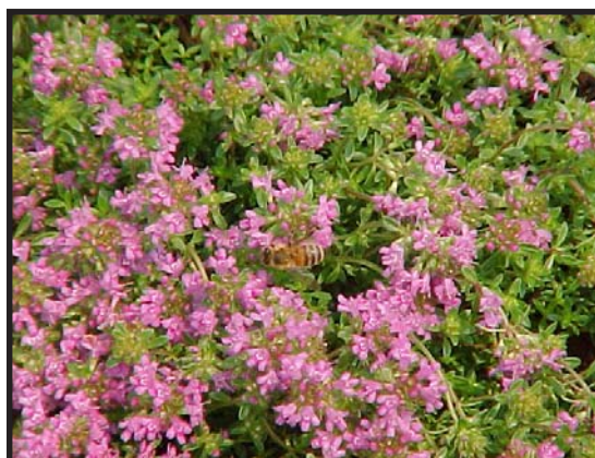
Figure 1. red-flowered creeping thyme ( thymus praecox ssp. arcticus 'Coccineus')

loosestrife ( Lythrum spp.) mallows ( Malva spp.) marsh marigold, cowslip ( Caltha palustris ) Miami mist ( Phacelia purshii ) mock orange ( Philadelphus coronaria ) money plant ( Lunaria annua or L. biennis ) motherworts ( Leonurus cardiaca & L. sibirica ) New Jersey tea ( Ceanothus americanus ) Onions, garlic, chives ( Allium spp.) phacelia ( Phacelia spp.) plums, peaches, apricots, cultivated cherries ( Prunus spp.) potentilla or cinquefoils ( Potentilla spp.) privets ( Ligustrum spp.) purple coneflower ( Echinacea purpurea ) raspberry ( Rubus idaeus ) redbud ( Cercis canadensis ) roses (occasionally some wild or near-wild types are attractive, Rosa spp.) Russian olive ( Elaeagnus angustifolia ) sages or salvia ( Salvia spp. most types but usually not red-flowered) sand cherry ( Prunus cistena ) Siberian peashrub ( Caragana arborescens ) smartweeds ( Polygonum spp.) speedwells ( Veronica spp.) spireas, ( Spirea spp.) St. John's-worts ( Hypericum spp.) strawberries ( Fragaria spp.) sumacs (including poison ivy) ( Rhus spp.) thistles ( Cirsium spp.) thymes ( Thymus spp.) tulip poplar ( Liriodendron tulipifera ) viper's bugloss ( Echium vulgare ) weigela ( Weigela florida ) white clover ( Trifolium album ) wild mustards & cresses yellow sweetclover ( Melilotus officinalis )