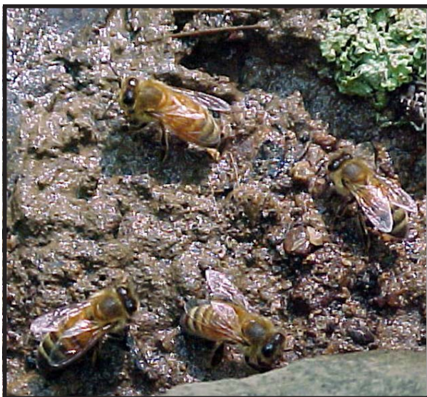
Figure 1. Water collectors in mud slurry

Just as with nectar and pollen foraging bees, all water collectors will not necessarily go to your water source. Some of the foragers are probably searching for sources of trace elements and minerals that clean water would not provide. But providing a convenient, clean water supply is a simple thing that beekeepers can do to help their colonies be successful.